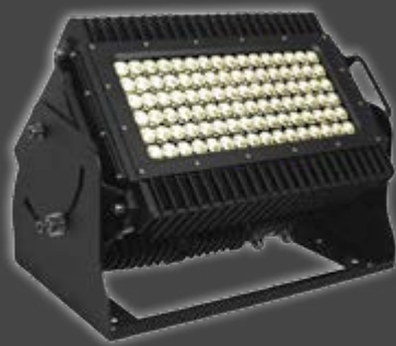
Flare IP HD

Brightest / Highest Reaching Outdoor LED RGBW Wash Fixtures