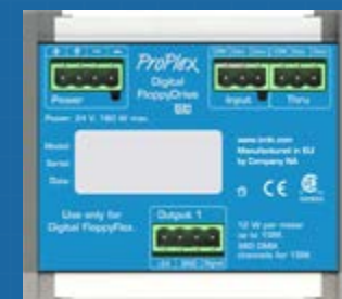
Digital FloppyDrive for Digital FloppyFlex

Indoor / Outdoor 12" and 24" complete NEMA enclosure kits available