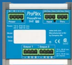
FloppyDrive DMX control for LED tapes and neon – 1, 2, 3, and 4 ch. versions

Custom underwater power and/or data cables configured for your specific application and water chemistry