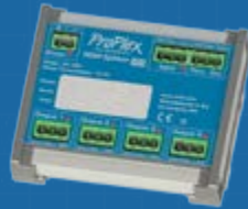
Opto-Splitter 1x4 DMX In / Thru, 4 DMX out

Also available: ProPlex RGB Drive DMX control for RGB LED neon and tapes. ProPlex Digital RGB Drive for Digital FloppyFlex.