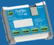
IQ 4-universe Ethernet-DMX Node