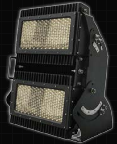
Flare IP HR