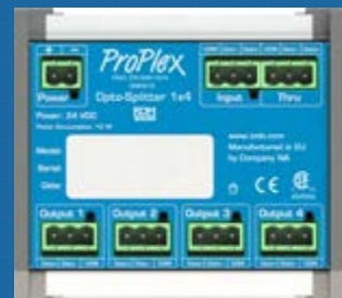
Opto-Splitter 1x4 DMX In / Thru, 4 DMX out