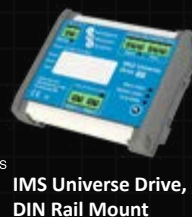
IMS Universe Drive, DIN Rail Mount