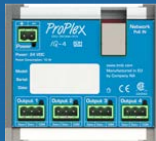
IQ 4-universe Ethernet-DMX Node