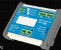
IMS Mk2 Universe Drive, DIN Rail