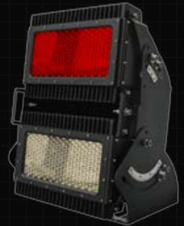
Flare IP HR