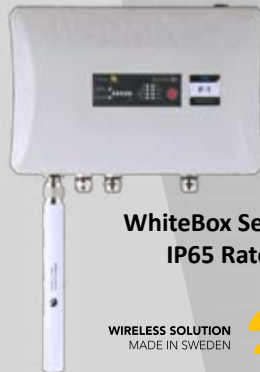
WhiteBox Series IP65 Rated