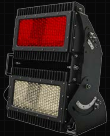
Flare IP HR