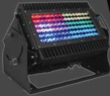
Flare IP HD

Brightest / Highest Reaching Outdoor LED RGBW Wash Fixtures